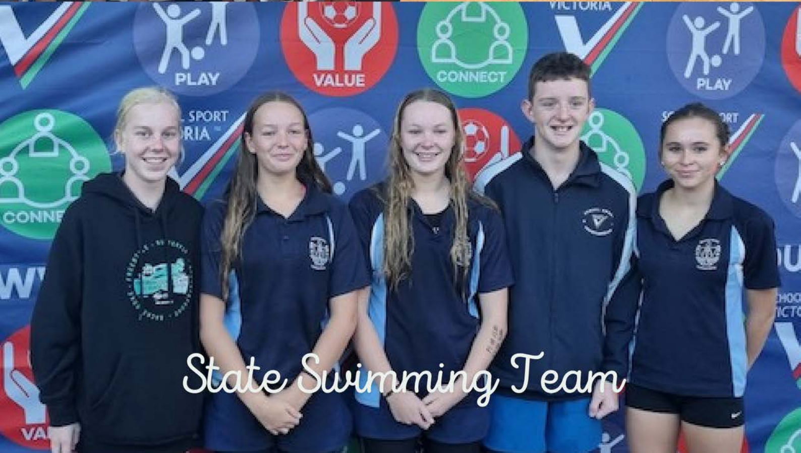
State Swimming Team