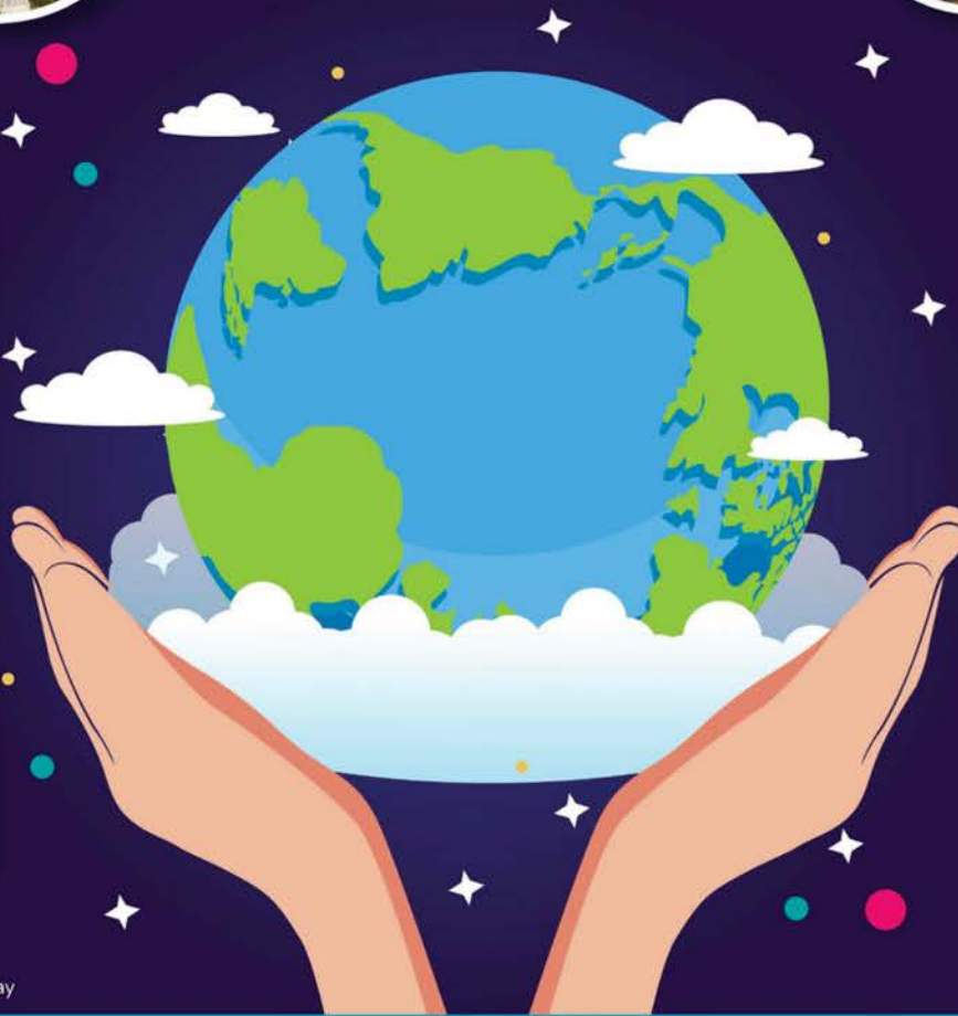
Earth image by HelloVector from Pixabay

“Leaving an inhabitable planet to future generations is, first and foremost, up to us” Laudato Si n160