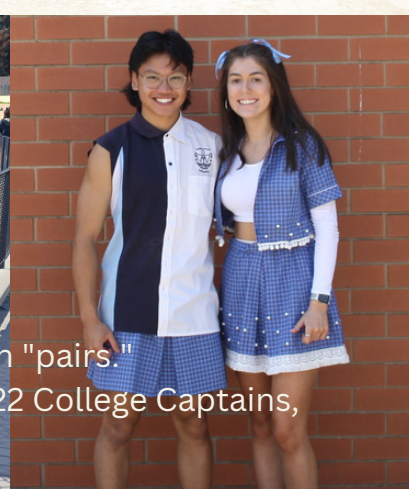
Year 12 celebrated their last day before exams by dressing in "pairs."